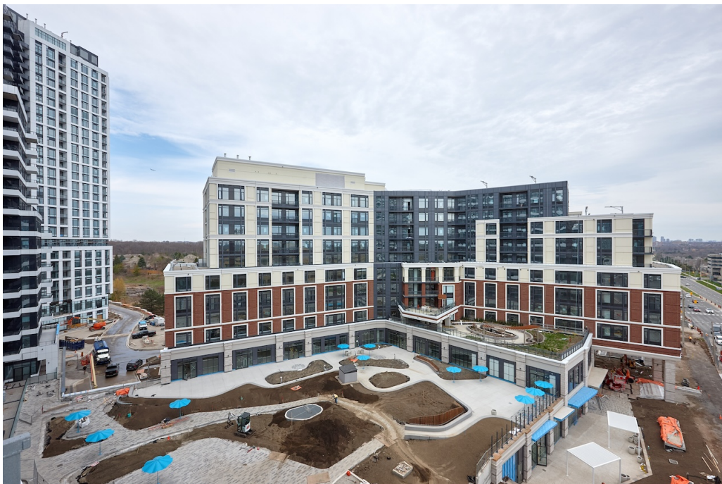
Amica Credit Mills

This approach is especially important during a time of pause and uncertainty across the industry. During this time, Daniels is strengthening and optimizing their construction methods through careful planning, discipline and leaning on long-standing trade relationships. Detailed coordination at the drawing stage enables resolution of construction challenges before work begins. Once on site, collaboration with trusted local trades and suppliers helps strengthen procurement and minimize delays.