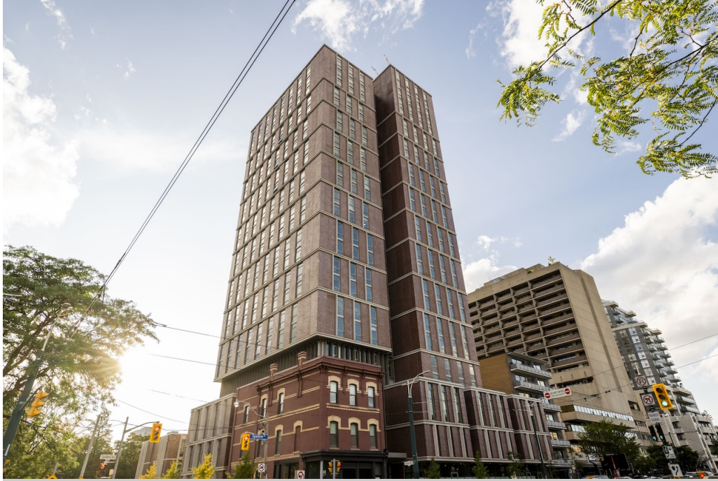
Oak House Student Residence

Daniels' experience further extends into student housing and institutional work, where delivery standards are often exacting. A recent example is Oak House , the 23-storey, 508-bed student residence delivered for the University of Toronto at Spadina Avenue and Sussex Avenue. The project demanded close coordination to meet institutional requirements for quality, safety, and sustainability within a dynamic campus environment.