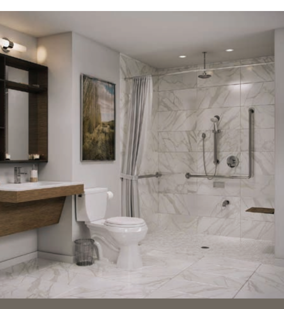
Roll-in shower example